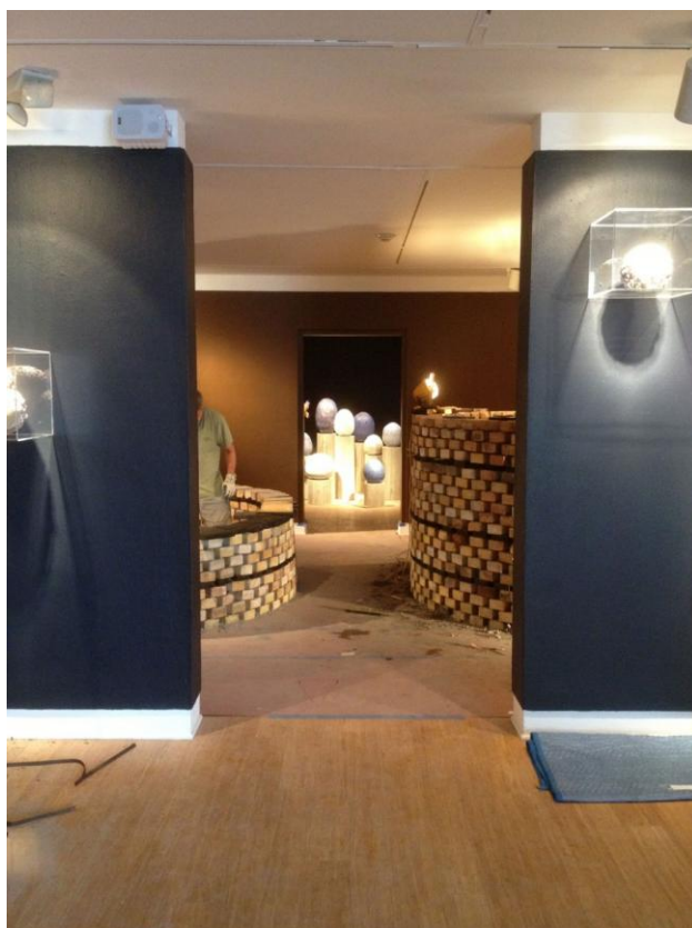
Laguna Art Museum installation process

The fourth gallery is not on access with the first three, but is entered from the side of the third gallery, and it contains two video collaborative pieces and an accompanying audio piece. One piece was a collaboration with Lucas Michael in 2008, a great artist from New York. In the piece, I have an almost spherical pot covered in white lave glaze. Lucas filmed the piece slowly rotating. In the museum, the original white pot sits on a pedestal in the dark and a video of itself rotating is projected back onto the pot, giving it a very confusing and beautiful second surface. It looks like something is happening to it that you cannot understand, as if some mysterious material is pouring over it, or that it is in some strange sort of motion. The second video piece was made with David Kelley, a filmmaker in New York. It is a piece about Le Corbusier's chapel in Ronchamp, France. In 1986 when David and I were both students at RISD, we visited Ronchamp with a film crew to make an ambitious documentary about the building. We used some of the footage shot in 1986 to make this piece. This was not a documentary, rather a piece that is meant to help the viewer experience the building through our eyes. This building is probably the single most influential piece of art in my life and my work as an artist.