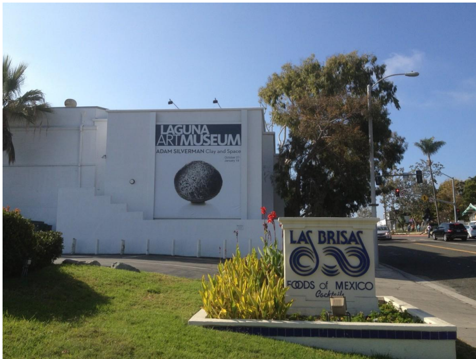
Laguna Art Museum

So far things have been evolving very naturally, and in a way it feels good, so I hope that continues. I am doing my first public art project next year on the corner of Santa Monica Blvd and Crescent Heights, which is very exciting. If that goes well, I think I'd like to do more of that work, but I also really like the scale and intimacy of making pots, so I imagine that will always be the foundation of what I do.