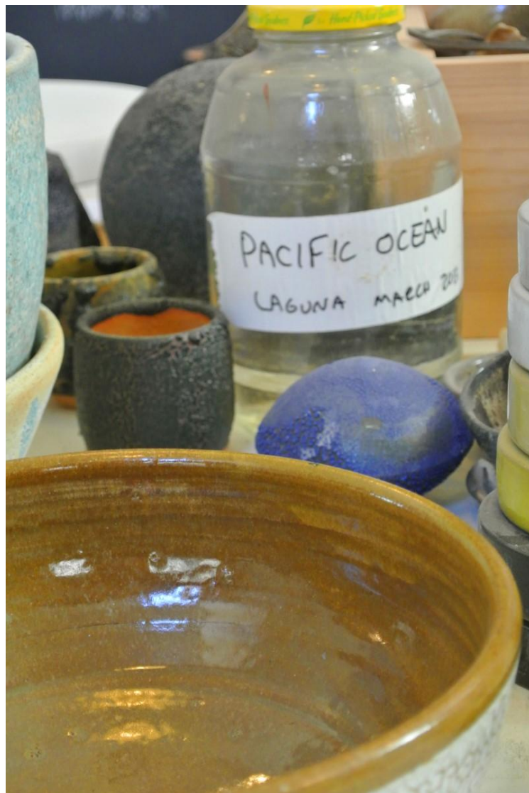
Adam Silverman's studio at Heath Ceramics

was an easy and obvious counterpoint to my usual practice. I have done different kinds of firing in different places over the years, but never a simple pit firing on the beach. Once that idea was hatched, I started gathering local materials to burn as fuel in the fire, as well as collecting local materials that could influence the environment in the fire and potentially affect the appearance of the pots. I used several different bodies from Laguna clay, then added slip made from local clay found in the Canyon onto some of the pots. I made salt from water taken from the beach, and collected driftwood, seaweed, and even kindling from the Canyon to burn. I was also able to find a local firewood supplier who makes his logs from local wood and tree-trimmers. So the fires were all burning materials from Laguna. In the end I am not sure if that makes any physical difference to the results, but I do think that it certainly does make a philosophical one.