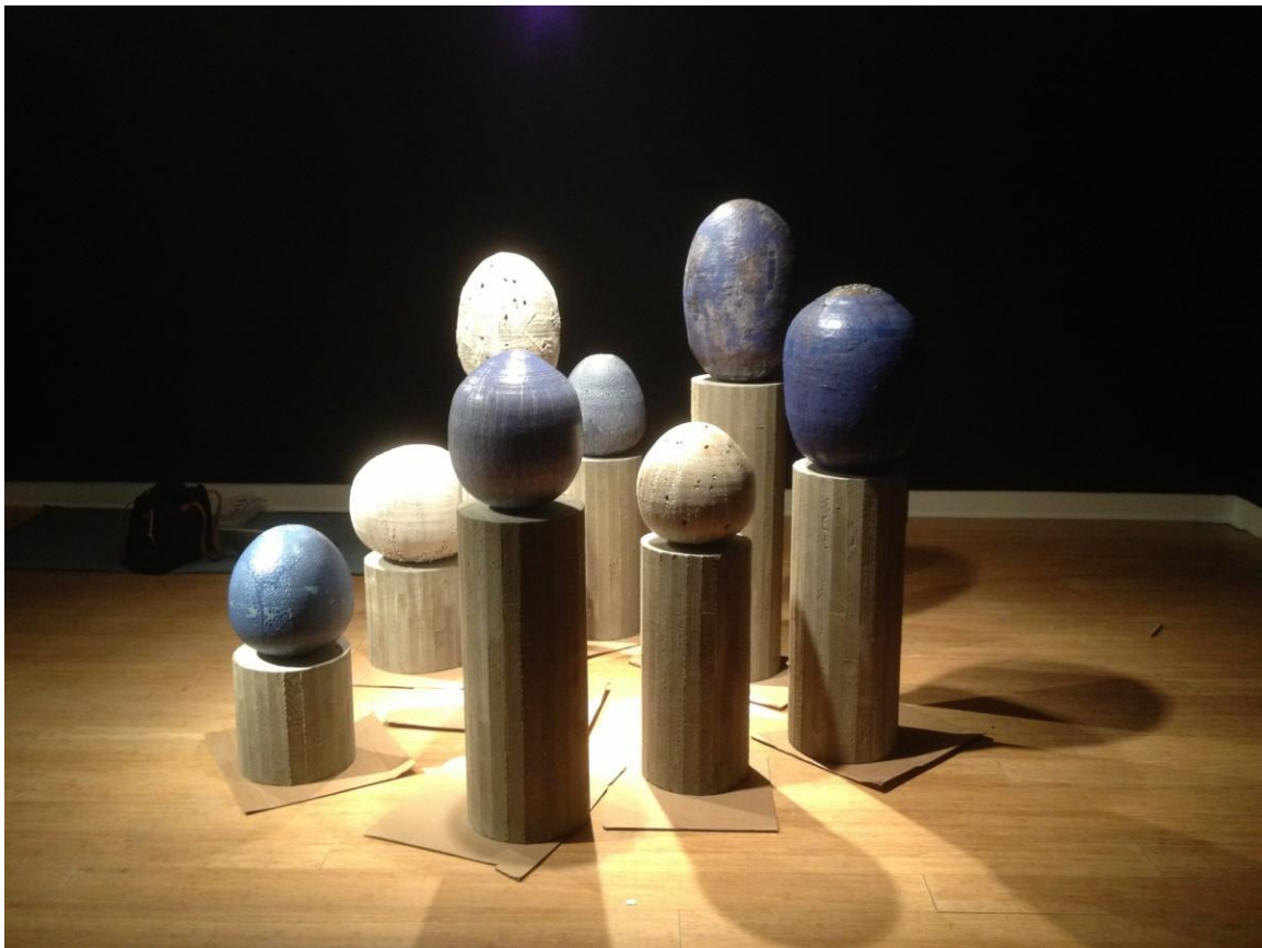
Laguna Art Museum installation process

In cinema the term auteur is used to describe a director who leaves an unmistakable mark on their work. I feel that your practice is no different. The finishes of your pieces feel like they're living organisms and capture moments of nature as its evolving.