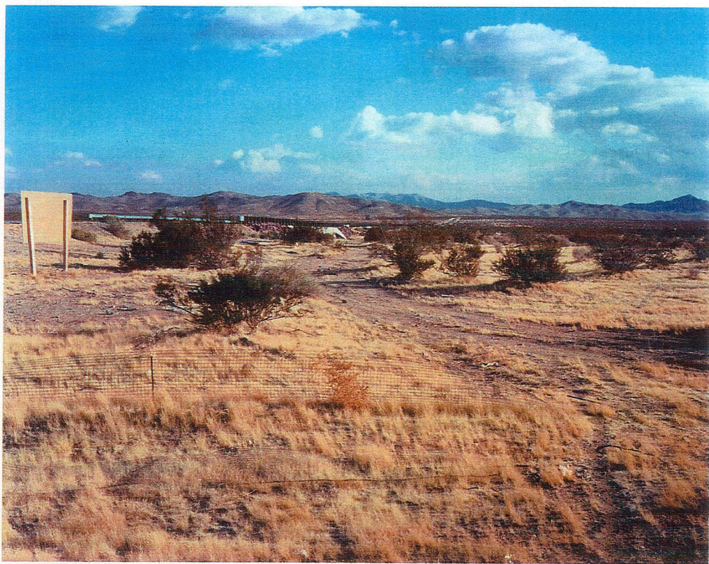
"Osborne Rd. & Mercantile Way" Barstow, 1999